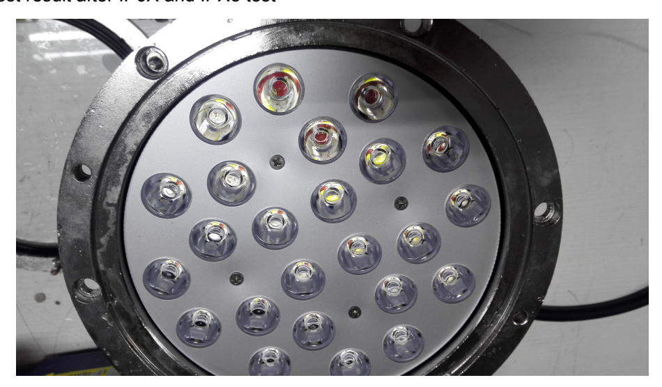
---- End of Test Report----